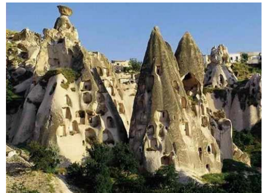
Cappadocian landscape of cave houses