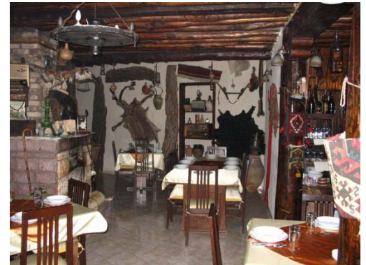
Sille Konak Restaurant

☐ 5:00 p.m.: Bus to Çatalhöyük, archaeological dig at the site of the oldest known civilization which dates back at least 8,000 years! Visit