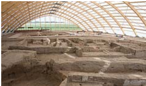
Excavation under the North Shelter at Çatalhöyük