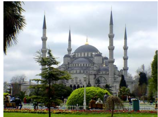
The Blue Mosque

4:00 p.m. Check in at the hotel, freshen up and relax.