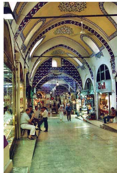
The Grand Bazaar

For children, spouses and friends during the alumni relations session: