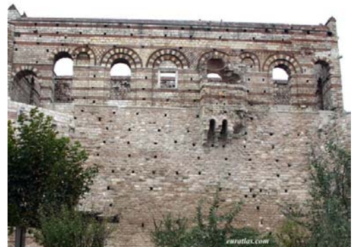
Tekfur Saray at Blachernae Palace