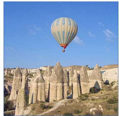
Balloon ride over the fairy chimneys of Cappadocia

☐ 2:00 – 5:00 p.m.: Independent sightseeing and activities around Cappadocia (extra charges may apply for certain activities) and lunch on your own. Buses will shuttle between the hotel and the two towns at various times during the day. Wander around the charming towns of Göreme or Ürgüp. Take a tour to see some of the landscape and churches with frescoes. Hike, bike or go horseback riding (rental costs and other fees may apply.) You can take a taxi to any activity that interests you.