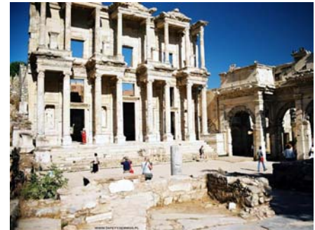
Herodium Corinth at Ephesus