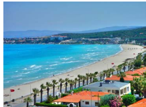
The beach at Çeşme on the Aegean coast

Full day: Visit Pergamom to see the magnificent Roman theatre and Trajan Temple, healing complex Asclepion and Allioanai – a Roman spa which is soon be covered under a modern dam. It is about 1 1/2-2 hours drive. Lunch can be at Pergamom at Saglam Restaurant or Berksoy – which has a pool where you can have a dip in between sightseeing. (Cost to be determined.)