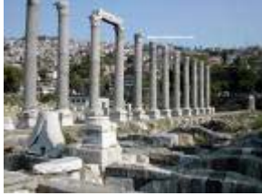
Columns at Izmir's Agora

12:00 – 1:15 p.m.: Friendship lunch hosted by Yaşar University