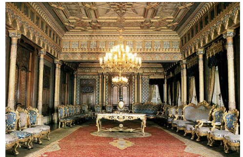
Yildiz Palace As of 3/25/2010

9:30 – 12:30 p.m.: Royal Hideout of a Recluse - Yildiz: Nineteenth century Sultan Abdulhamit chose to seclude himself for thirty years in the gardens of Yildiz Palace ( right next to the Conrad! ) where he built about 60 mansions and other buildings which housed his household and their attendants. Our tour will include the private quarters of this reclusive sultan and the Chalet which he had built to house Kaiser Wilhelm during his visits to Istanbul. The dining room at the Chalet and the exterior façade of the building are decorated with some rare original pieces from the Çırağan Palace (now Kempinski Hotel), which were moved (borrowed!) as the