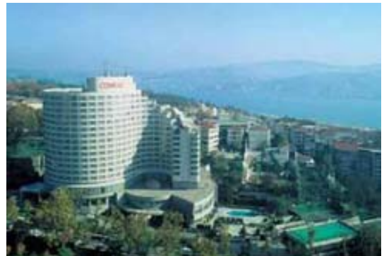
The Conrad Istanbul Hotel

YaleGALE and AYA will host an open conference on alumni relations for Turkish universities and for alumni of the IARU universities. The program will feature opening and closing plenary sessions, workshop sessions and a major exhibition of alumni programs led by Yale alumni. Probable venue: Conrad Istanbul Hotel. See attachment for details.