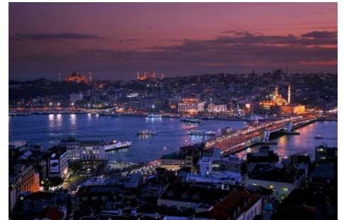
Istanbul at night

For more information: www.yalegate.org/yaleturkey.htm