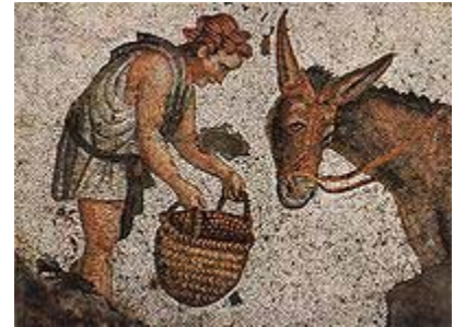
Floor mosaic of a child and a donkey (c. 5 th century)

2:30 – 5:30 p.m.: Less Frequented Sites of Istanbul: Behind the Blue Mosque: Stay in the old city after the photo hunt for lunch or join the group from the Photo Hunt for a walking tour that will take you first to the Mosaic Museum where magnificent mosaics from the Byzantine Palace can be observed. We then continue down the hill and view the support walls of the ancient hippodrome which now support modern structures. Around the corner is the exquisite Sokollu Mehmet Paşa Mosque, which in the opinion of many art historians is the masterpiece of the great architect Sinan. We then continue to visit the sixth century church of Sergius and Bacchus, the plan of which has been the inspiration for San Vitale in Ravenna, Italy. We return to the palace along the waterfront remains of the Byzantine Palace. ($55 per person/minimum of 10 people)